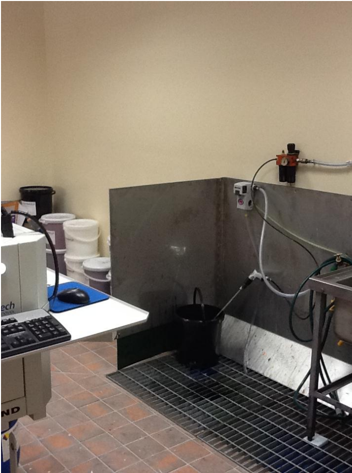
Contained mixing and washing area.