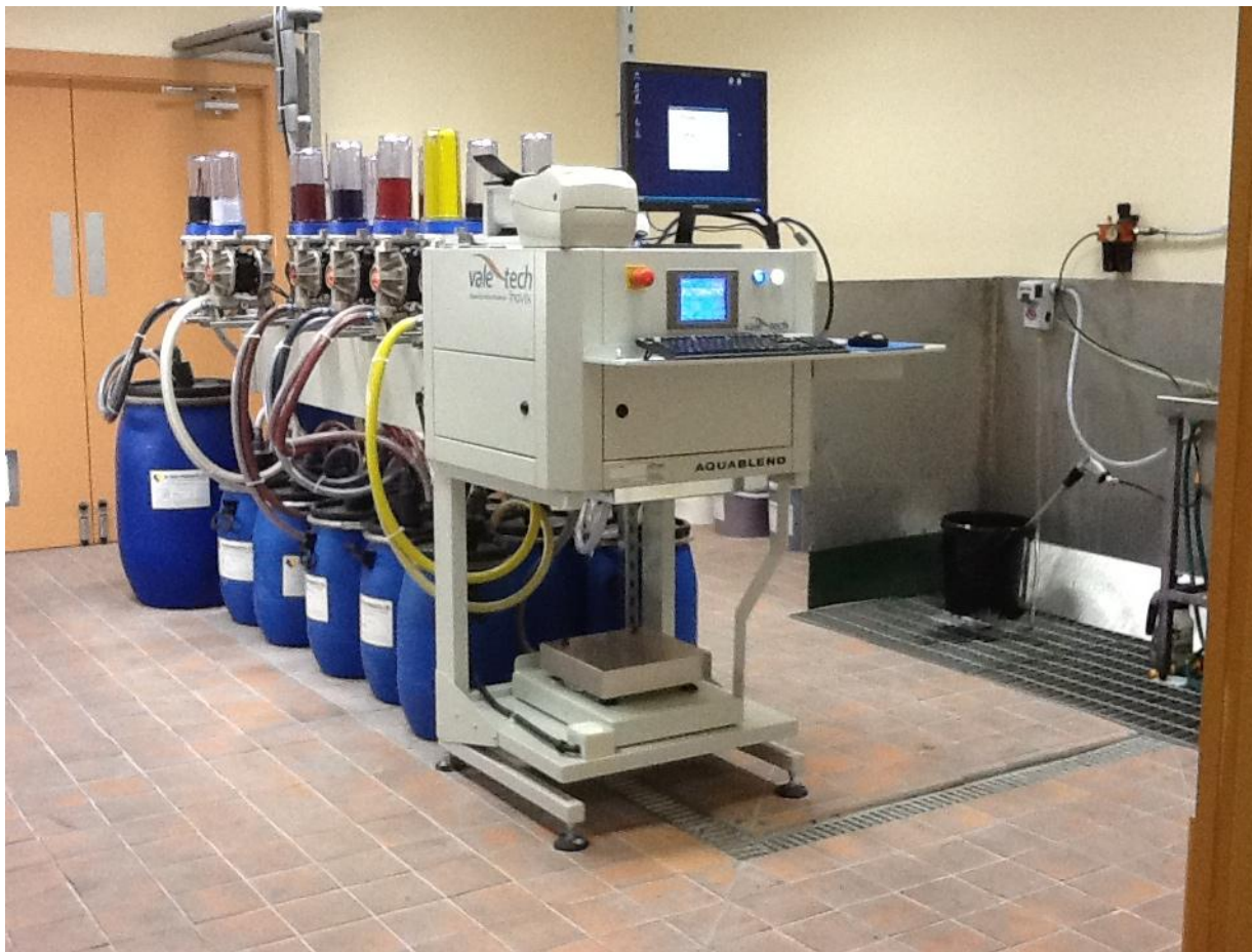
The finished dispenser in its new home.