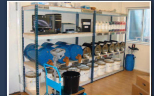
Mini-Blend Manual Ink Kitchen