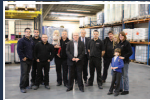
The team at Hi-Tech Products